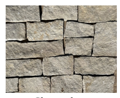
Chopped Height 3"-12"