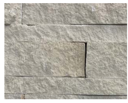
Sawn Height* 1.25"-12"

*This stone contains less than 5% golden roughback if any at all.